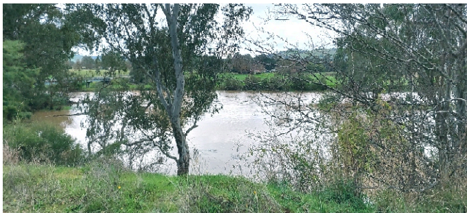
View from Acheron Road looking back towards the bridge on June 8th.

A feeling of deja vu was experienced when looking down from the bridge over the Acheron on the 8th of June.