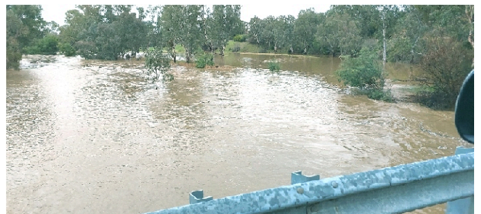
View from the Acheron River Bridge on June 8th.