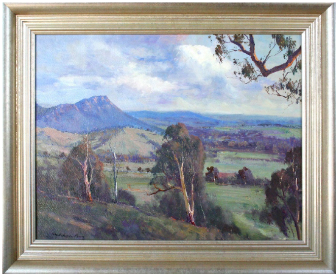
Photograph of the Wykeham Perry painting - 'View of Acheron Valley', valued at $750.00.

The raffle will be drawn on Sunday 15th June at the Centenary Ceremony.