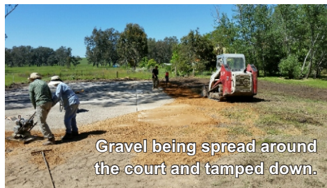
Gravel being spread around the court and tamped down.

Members have been busy in recent weeks refurbishing the tennis court, which was built in 1928. The cottonwood trees have