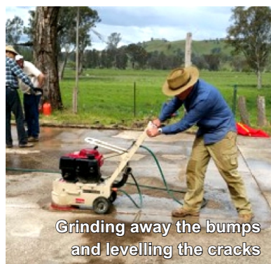
Grinding away the bumps and levelling the cracks