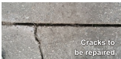
Cracks to be repaired