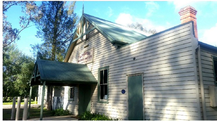
Three quarter view of hall - painting finished.