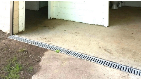
Toilet block upgrade with new rainwater drainage.