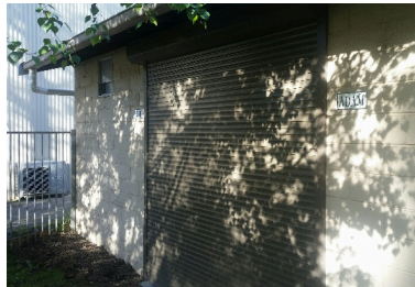
Toilet block external roller door.