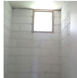
Weather proof windows.