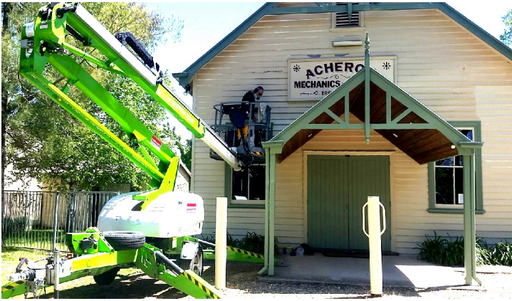
Front view of hall with Cherry picker - work in progress.